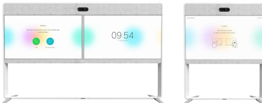
Figure 1. Cisco Spark Room 70 Dual and Cisco Spark Room 70 Single on Free-standing Floor Stand

* Integrated microphones for speaker tracking only