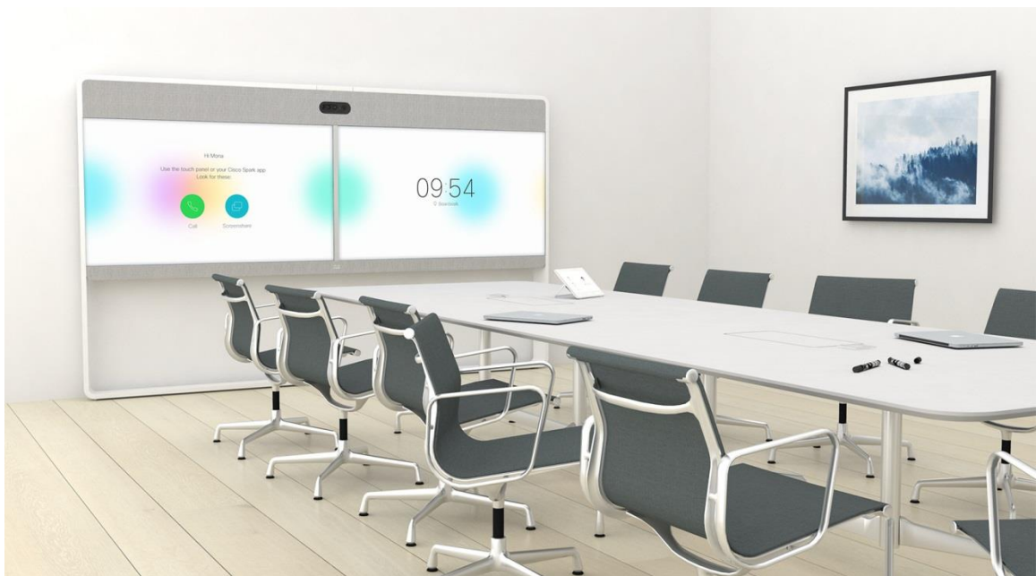
Figure 2. Cisco Spark Room 70 in large conference room